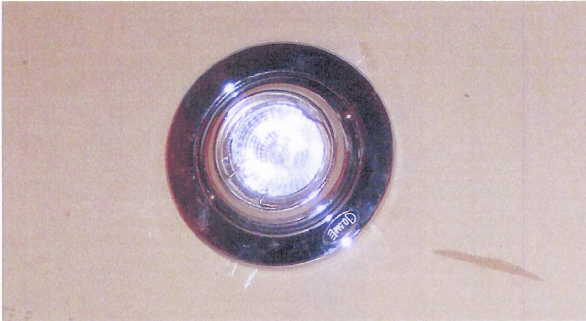
JCC Downlighter (Ref. JC3009)