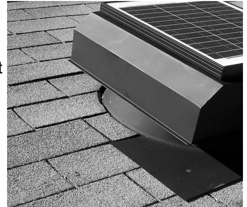
Fig. 5 - Installing the Attic Vent

Step 10 - Installing the Attic Vent: Using the roofing knife, cut a 4 inch gap in the shingles and tar paper at the 3 o'clock and 9 o'clock positions of the attic hole to allow the attic vent flashing to slide underneath. Position the attic vent unit so that it is horizontally centered with the attic hole. Slide the square flashing of the attic vent unit, underneath the shingles and tar paper, into the gap that was cut at the 3 o'clock and 9 o'clock positions of the hole. Lift the unit up at an angle while still in position. Note that the thermal switch (if included) should be hanging freely into the attic from the fan unit. Using the caulking gun, run a bead of caulk on the bottom side of the flashing facing the roof. When finished, continue sliding the unit upward and underneath the shingles until it is positioned directly over the attic hole. The cylindrical part of the attic vent should be touching the cut out edge of the shingles when the unit is aligned directly above the hole (see Fig. 5).