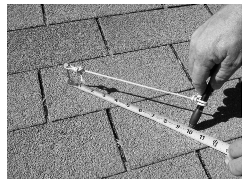
Fig. 1 - Marking the Attic Hole

Step 5 - Marking the Attic Hole: Hammer a nail part-way into the roof in the approximate center of the area chosen to install the attic vent. Tie one end of string to a permanent marker, and the other end to the nail. The knot tied to the nail should allow the string to move freely in a circle around the nail (i.e. no winding of the string around the nail). Adjust the length of the string so that when the marker is pulled tight on the string, it measures 10 inches from the nail (see Fig. 1). Keeping tension on the string with the marker, trace out a circle onto the roof. The resulting circle will have a diameter of 20 inches.