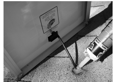
Fig. 4 - Mounting the Solar Panel

Step 8 - Mounting the Solar Panel: If installing Attic Breeze models AB-201A/202A/251A/252A, skip ahead to Step 10. Depending on the mounting bracket option you have chosen for your remotely mounted solar panel, you will need to either drill a hole in your roof or attic wall to accommodate the solar panel wire. Using a power drill equipped with a ½ inch bit, drill a hole in the roof centered over the area chosen for your solar panel or in the attic wall near your adjustable bracket. Insert the solar panel wiring through the hole and into the attic. Using the caulking gun, seal around the hole and wire (see Fig. 4). Install the solar panel as directed by the instructions included with your specific mounting bracket kit.